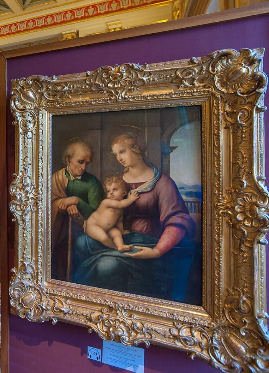
124 Raffaello Sanzio Urbino La Vergine e il Bambino con Sant' Giuseppe 1505-1506 Collezione di dipinti Museo di Capodimonte, Napoli